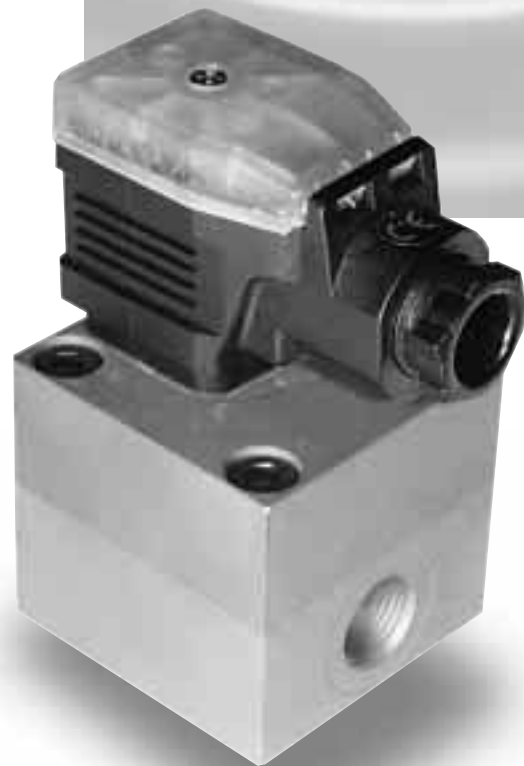
Volume counter VCA 0,2 FA R1